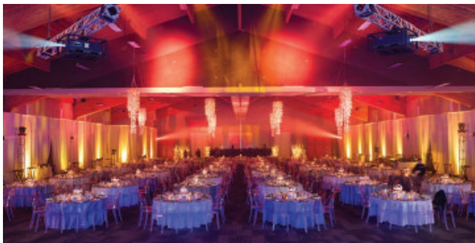
Post-meeting, try the zip line of Ziptrek Ecotours (above); Whistler Conference Centre (below) features nearly 40,000 square feet of meeting and event space.