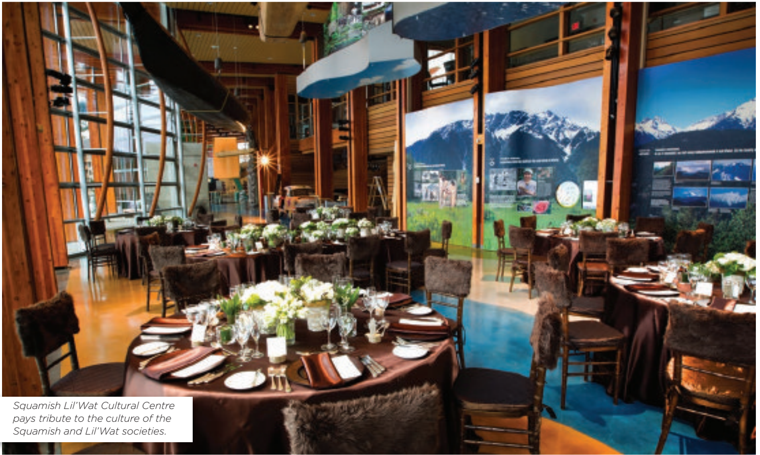
Squamish Lil'Wat Cultural Centre pays tribute to the culture of the Squamish and Lil'Wat societies.