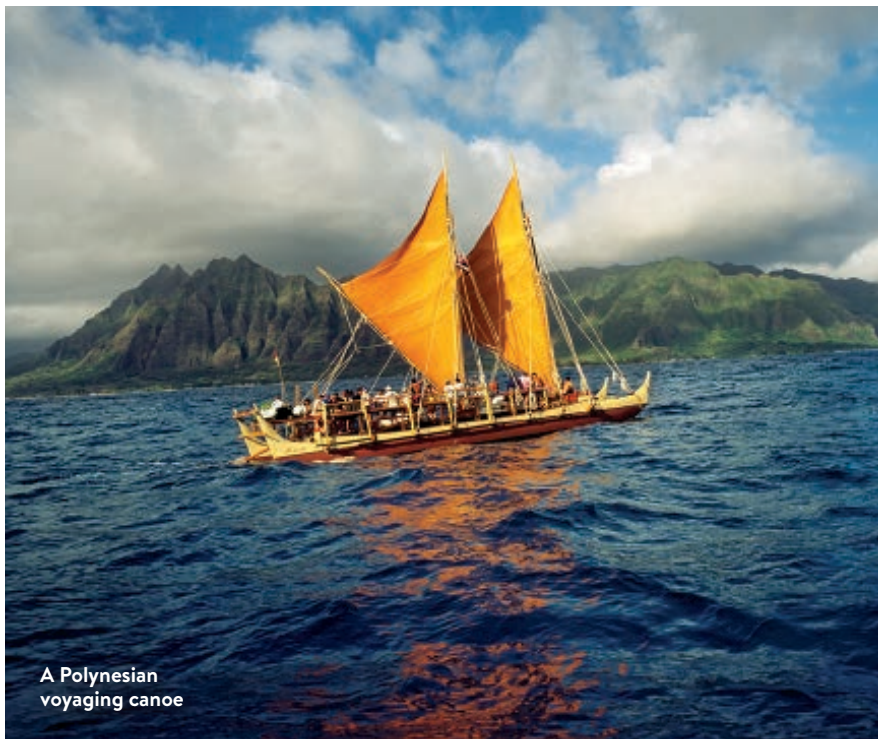
A Polynesian voyaging canoe