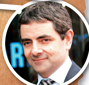
Glenn Close and Rowan Atkinson are just two of the celebrities who have been spotted staying at Ziggy Bay.