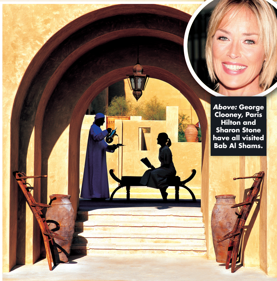
Above: George Clooney, Paris Hilton and Sharon Stone have all visited Bab Al Shams.

Bab al Shams Desert Resort & Spa, Al Quadra Road, Dubai, UAE Tel: +971 (0) 4 809 6100, Fax: +971 (0) 4 832 6698 Email: JBASReservations@jumeirah.com Website: www.jumeirah.com