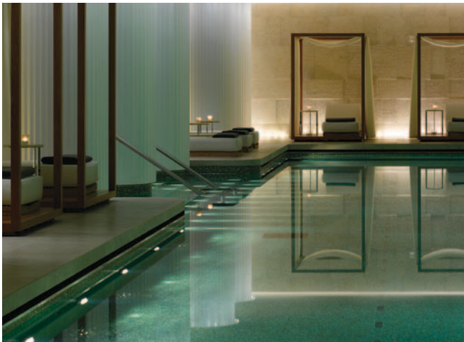
IMAGES: FROM TOP: MALE CHANGING ESPA LIFE AT CORINTHIA; MARGARET DABBS ; POOL AT BULGARI SPA