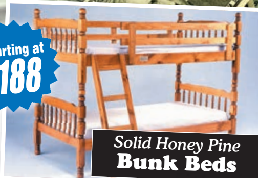
Solid Honey Pine Bunk Beds