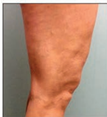
Before and After 20 min in-office procedure