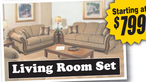
Living Room Set

8-piece Living Room Set Includes coffee table, end tables & 2 lamps