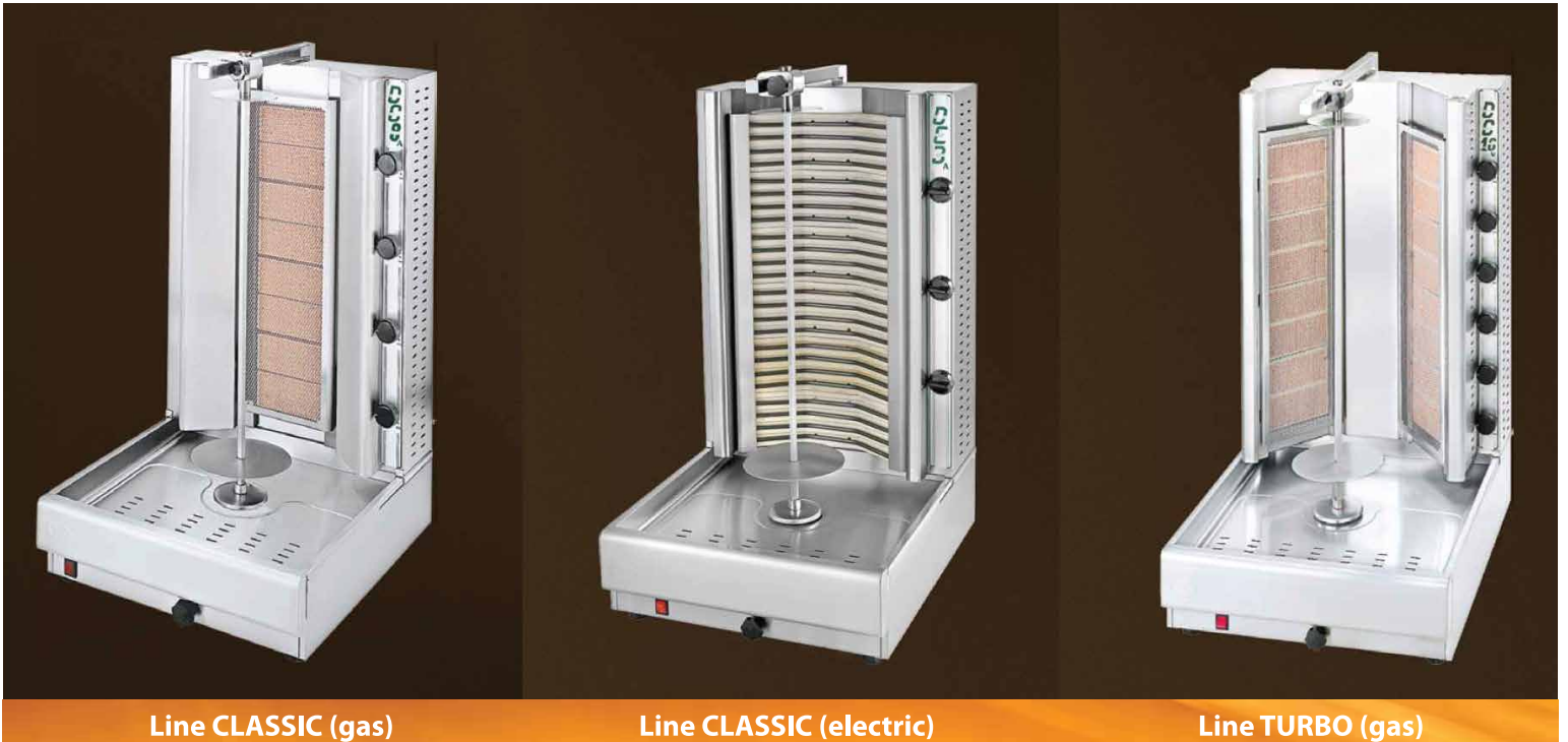
Line CLASSIC (gas)

Manufactured and imported directly from Greece, the home of the gyro!