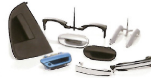
DOOR HANDLE TRILOY 170, SG 110