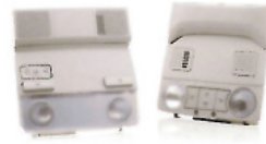
ROOM LAMP TRIEX 3025U/3022L1 TRILOY 540