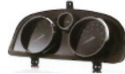
CLUSTER TRIEX 3025U, 3022IR, 3022L1