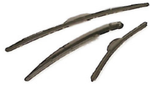
WIPER TRIPET 2500G45