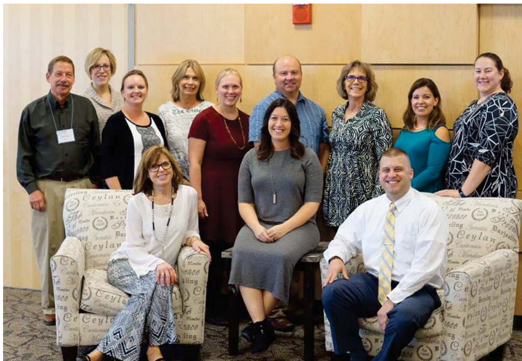
PHARMACOLOGY CONFERENCE 2017