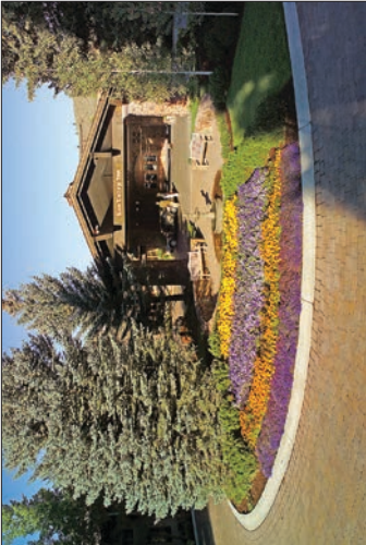
Sun Valley Lodge