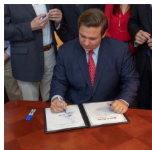
APRN Independent Practice Bill Signed