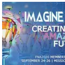
2020 FNA Assembly