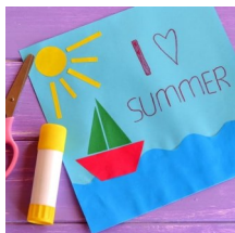
Zoom Webinar: Summer Kids Activities