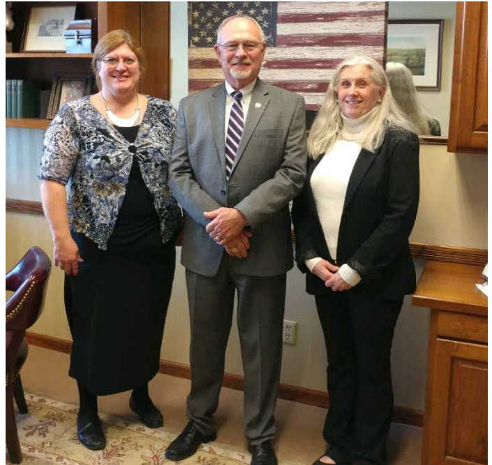
Advocacy Day, April 18th