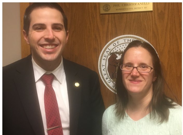
Advocacy Day, February 7th