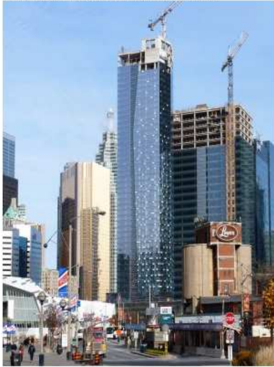
Delta Hotel, Toronto skyscraper, Canada:

Despite Toronto's significant growth in terms of high-rises, set to become clearly noticeable on the city's skyline in the coming years, New York remains the city with the most completed high-rises in North America: As of today, 6,069 of these structures reach for the sky above the "Big Apple" – three times as many as in Toronto.