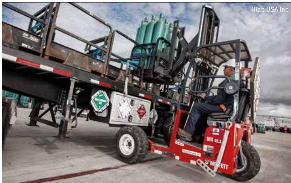
Hiab USA Inc.