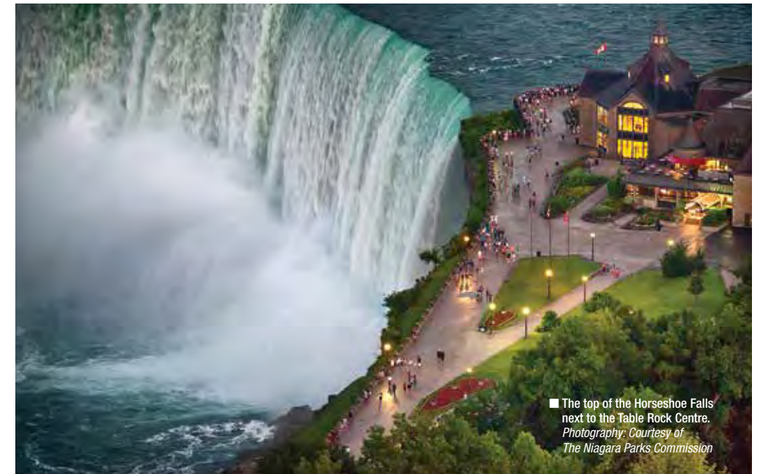
■ The top of the Horseshoe Falls next to the Table Rock Centre.