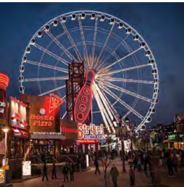
■ The Niagara Skywheel located on Clifton Hill provides amazing views of the falls.

Niagara Falls Bridges ( provides real-time traffic updates on border crossings ): niagarafallsbridges.com