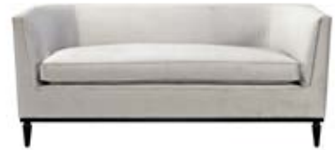
MONROE LOVESEAT seal grey / onyx w 72" d 32.5" h 30.5" style no. 1435-02