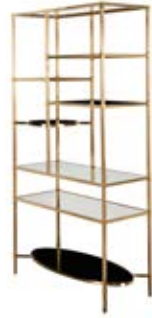
DUNCAN ETAGERE vintage mirror and black back painted glass shelves / polished brass w 40" d 18" h 80" style no. 1405-49