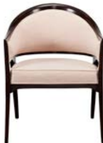
EVERDENE ACCENT CHAIR pink sand / bittersweet w 25" d 25" h 32" style no. 1439-03