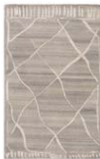
SKETCH available in heather grey, light upper west side, cream