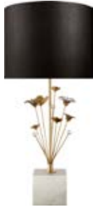
KEATON TABLE LAMP marble base shown in gild with black linen shade, also available with cream linen shade; also available in burnished silver leaf or light cream with cream shade w 13" h 36"