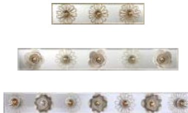
KEATON VANITY LIGHTS available in gild, light cream and burnished silver for all sizes w 18" h 4" / w 30" h 4" / w 36" h 4"