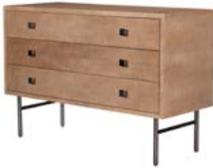
ALDEN CHEST grey sycamore / gunmetal w 48" d 20" h 33" style no. 1405-48