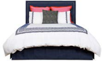
FILMORE BED w 68" d 93" h 56" FILMORE HEADBOARD w 68" h 56" indigo / off-white, shown in queen; available in twin, queen, king, cal king style no. 1438-10