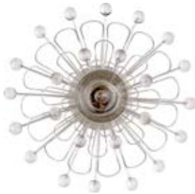
KEATON WIRE FLORAL SCONCE burnished silver, also available in gild and light cream w 12" h 12"