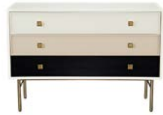
ALDEN CHEST back painted glass in cream / mushroom / onyx; polished brass w 48" d 20" h 33" style no. 1404-48