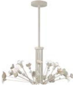
KEATON LARGE BOUQUET CHANDELIER light cream, also available in burnished silver and gild w 36" height varies