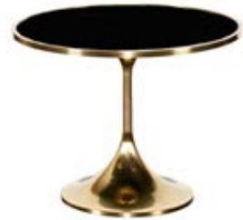
MINI ELLERY SIDE TABLE brass / black glass d 20.5" h 16" style no. 1421-42