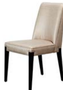
NORWICH DINING CHAIR latte / onyx w 20" d 25" h 38" style no. 1436-28