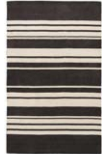
HAMPTON STRIPE new colors: dark straw, heather grey, licorice