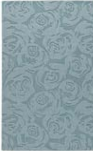
ROSE GARDEN new colors: chambray and straw