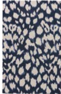
LEOPARD IKAT new colors: dark navy