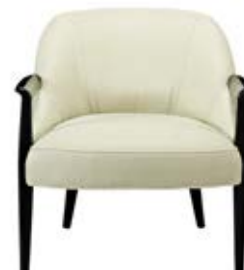
DAVENPORT LOUNGE CHAIR garden / onyx w 28.5" d 32" h 30" style no. 1451-03