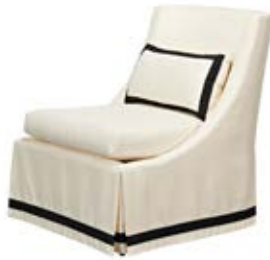
RUSSELL ARM CHAIR sesame / black grosgrain trim w 31" d 36" h 35" style no. 1436-03