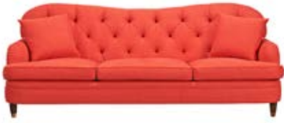
DRAKE TUFTED SOFA red / bittersweet w 94" d 40" h 35" style no. 1430-01