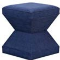
CORBETT OTTOMAN indigo w 16" d 16" h 19" style no. 1452-09