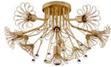
KEATON BOUQUET FLUSH MOUNT gild, also available in burnished silver and light cream w 22.75" h 11.25"