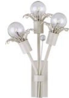
KEATON MINI BOUQUET SCONCE light cream, also available in gild and burnished silver w 8" h 10.5"