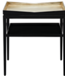
CHARLESTON END TABLE pale gold leaf / onyx w 23" d 17" h 25" style no. 1412-42