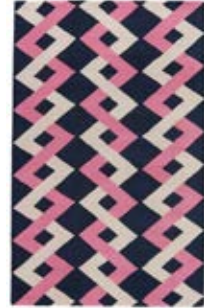
ZIG ZAG available in dark navy, chambray, princess green, heather grey, dark straw