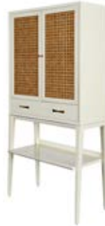
CALYPSO CABINET natural caning / cream / mirrored interior w 34" d 16.25" h 68.5" style no. 1411-25