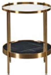
FULLERTON END TABLE glass / black marble / polished brass d 20" h 25.25" style no. 1415-42