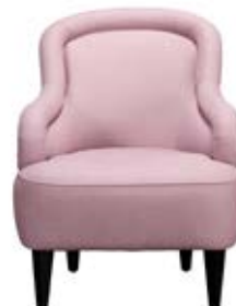
DRAKE SLIPPER CHAIR lilac / bittersweet, also available in begonia w 29" d 32" h 35" style no. 1434-03