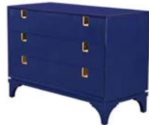
DOWNING CHEST french navy / polished brass w 48" d 22" h 34.25" style no. 1400-48