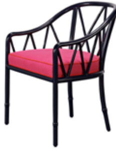
HALSEY CHAIR watermelon / maraschino / navy w 24" d 24" h 31.5" style no. 1454-27