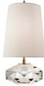
CASTLE PEAK ACCENT LAMP crystal with cream linen shade w 11" h 21.5"