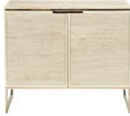
DOVER CHEST beige marble / grasscloth / polished brass w 38" d 19" h 32.5" style no. 1402-06