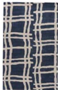
BROKEN PLAID available in dark navy, platinum, heather grey, black, cream, blush