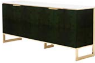
DOVER CREDENZA white marble / stained walnut / polished brass w 77" d 19" h 32.5" style no. 1401-21