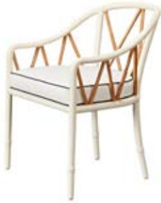
HALSEY CHAIR canvas / black / cream / natural w 24" d 24" h 31.5" style no. 1449-27