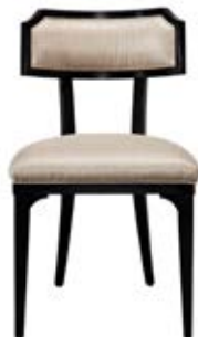
WORTHINGTON CHAIR latte / onyx w 19" d 22.375" h 33" style no. 1437-03