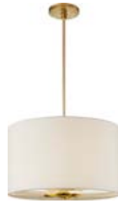
KEATON LARGE FLORAL HANGING SHADE gild with cream linen shade, also available in burnished silver with cream linen shade w 22" height varies