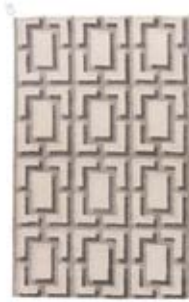
GEO SCREEN new colors: straw and heather grey