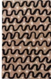
WAVES available in chambray, heather grey, medium pink, princess green, dark straw, platinum