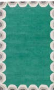
SCALLOP EDGE available in princess green, dark navy, dark straw