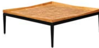
CHARLESTON SQUARE COFFEE TABLE natural burl / onyx base w 40" d 40" h 14" style no. 1406-40