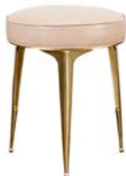
SYRIE STOOL pink sorbet / brass, also available in jazzy blush d 15" h 19" style no. 1453-09