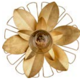
KEATON MIXED FLORAL SCONCE gild, also available in burnished silver and light cream w 11" h 11"