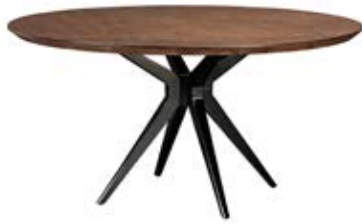
STARBURST DINING TABLE grey burl / onyx d 60" h 30" style no. 1401-20