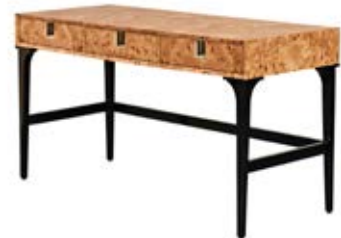
DOWNING DESK natural burl / onyx / brass pulls w 56" d 24" h 31" style no. 1400-45A