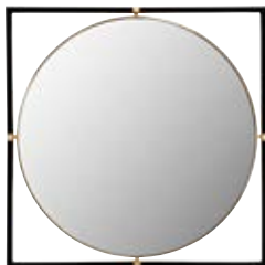
HUMPHREY MIRROR black metal / polished brass w 27.5" d 1.5" h 27.5" style no. 1406-04