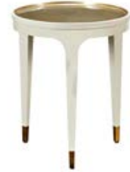
THACKERY SIDE TABLE pale gold leaf / cream / brass ferrules removable tray top d 16" h 19" style no. 1413-42