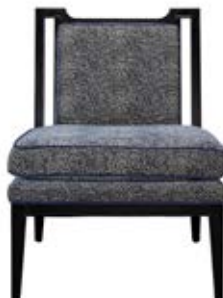
STILLWELL LOUNGE CHAIR navy with cream dots / onyx w 25" d 31" h 32" style no. 1438-03