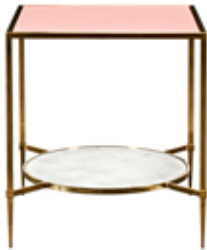
DUNCAN SIDE TABLE back painted glass in begonia / antique mirror / brass w 20" d 20" h 22" style no. 1405-42VMG