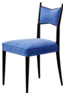
GEORGIA CHAIR cobalt / onyx w 18.5" d 20.25" h 37" style no. 1440-28