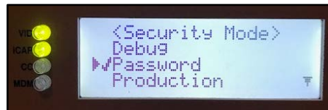
Figure 1: Password security mode selected