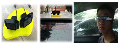
Figure 5: Implementation Systems

The camera node is launched and then initialized; that is, the image size is confirmed. Then it is connected to the image