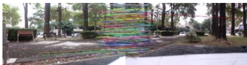
Figure 2: Feature Points of Images