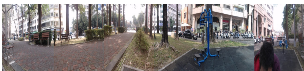
Figure 3: Illustration of Image Overlay