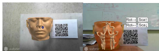
Fig 3: The results of the MR display

In addition, a cursor is added which can change the virtual objects' rotation angle and scale factor, and also facilitate the doctor to understand his current position in space.