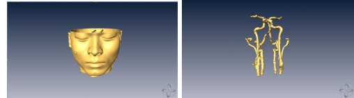
Fig 1: (a) Dummy Head Model; (b) Model of Vascular Tissue

head of a patient. First, a CT scan of the dummy model was processed to capture the region of interest, and a threshold value was used on the processed results, which are then stacked to obtain the 3D modeling data shown in Fig. 1.