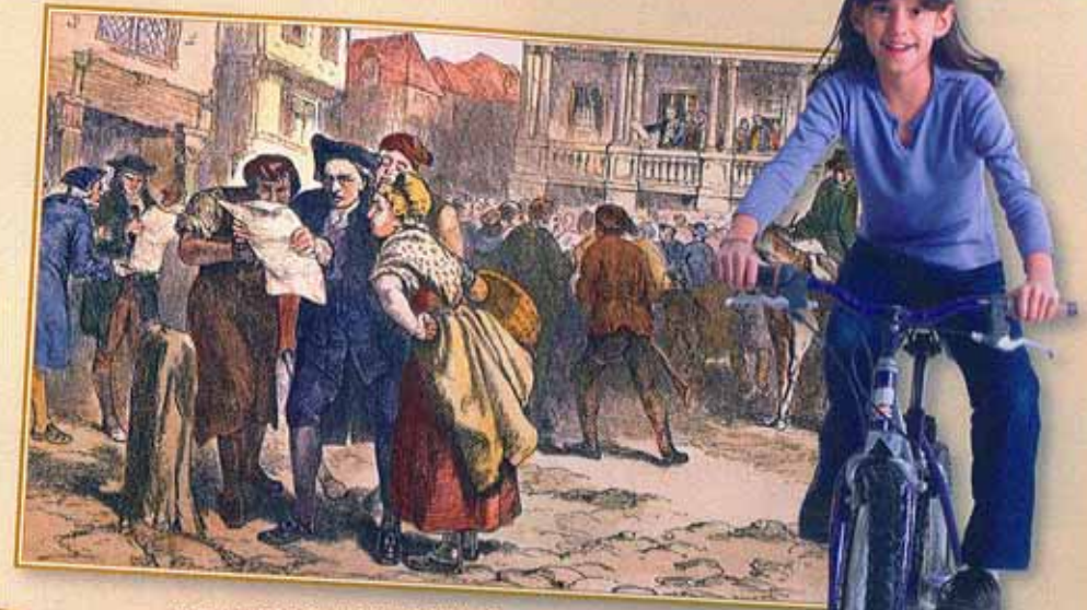
READING THE NEWS