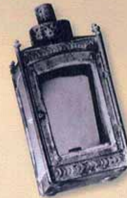
LANTERN USED TO SIGNAL PAUL REVERE