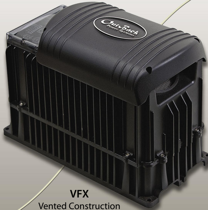
VFX Vented Construction