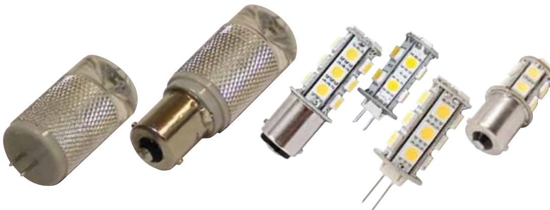
JC10/20 LED2 1.5W/2.5W