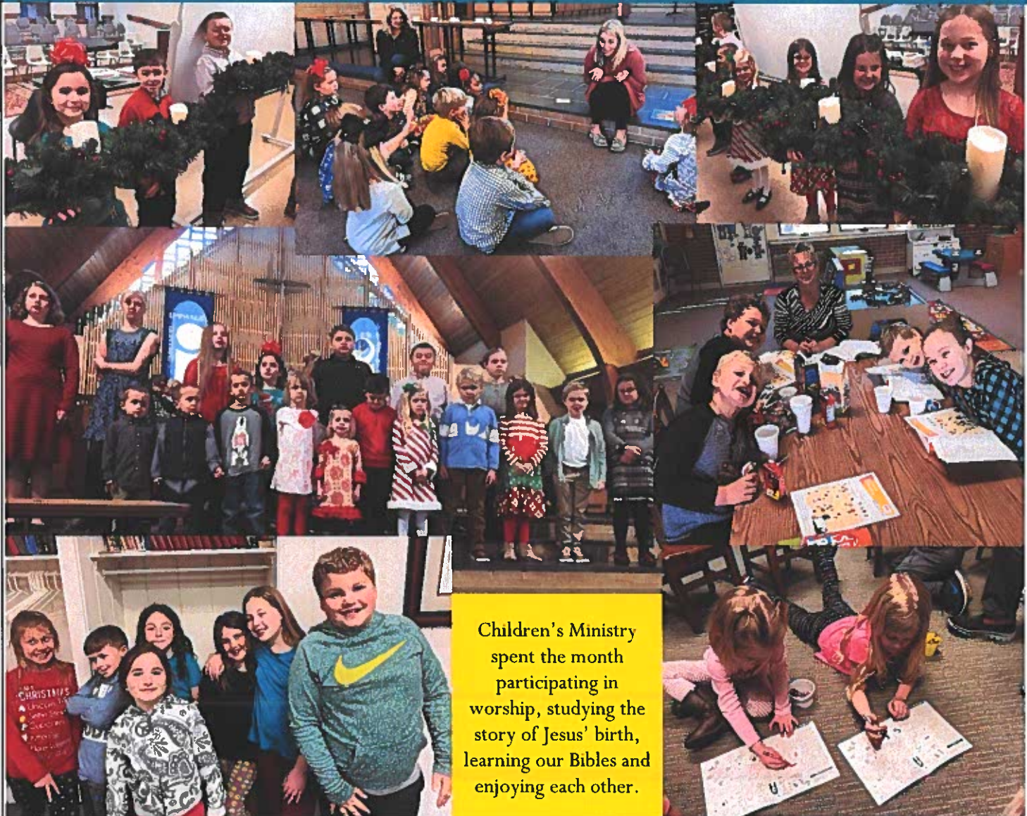
Children's Ministry spent the month participating in worship, studying the story of Jesus' birth, learning our Bibles and enjoying each other.