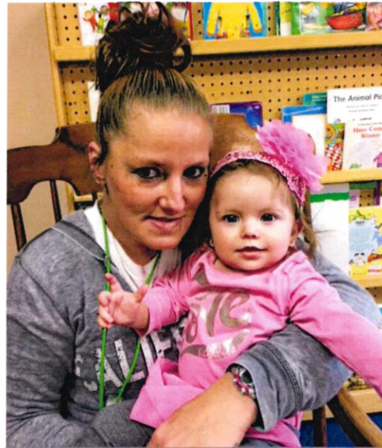
Lydia House For Women And Families A Ministry of Open Door Mission