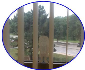
Just enjoying God's creation!

Pick up a copy to color & cut out, located in the Parlor area! Take him with you on your daily outings or on vacation! Snap a picture of Flat Wesley & post-it on Facebook!