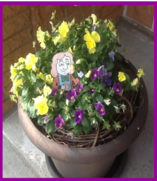
Stopped to smell the flowers!