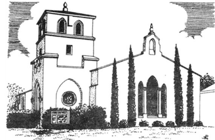
First United Methodist Church