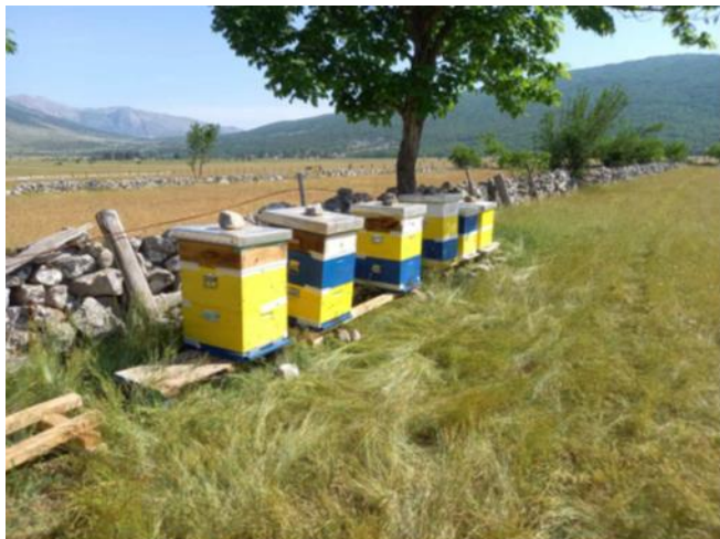
Beehives moved to the mountain valley for summer

In this newsletter, we want to update you on two other projects our Fellowship supported last year – the honeybee and laying hen projects. Funds for these projects came through a partnership with a Louisiana organization called Mission Agricultural Resource Services. We appreciate their continued partnership as together we try and make a difference in the lives of people who need both physical and spiritual provision.