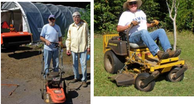
Volunteers from Honokaa UMC keeping the camp grounds maintained.