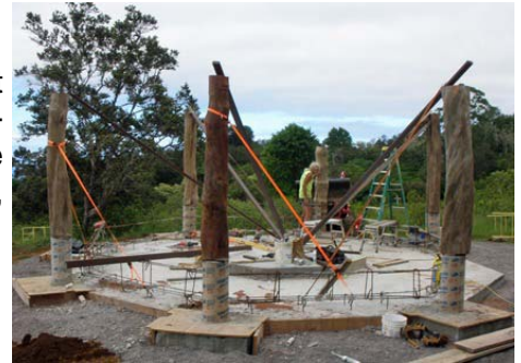
Ohia logs supporting the chapel structure.