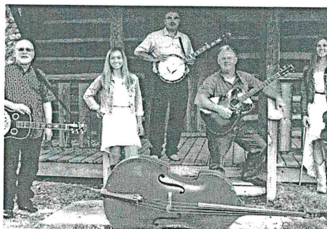
Music by – Shortly Thereafter , Sat., Aug. 3 rd