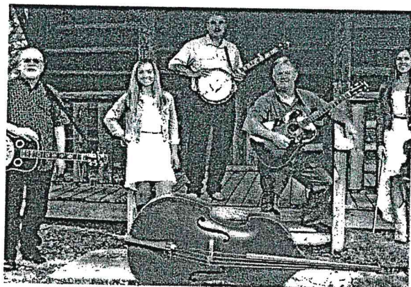
Music by – Shortly Thereafter , Sat., Aug. 3 rd