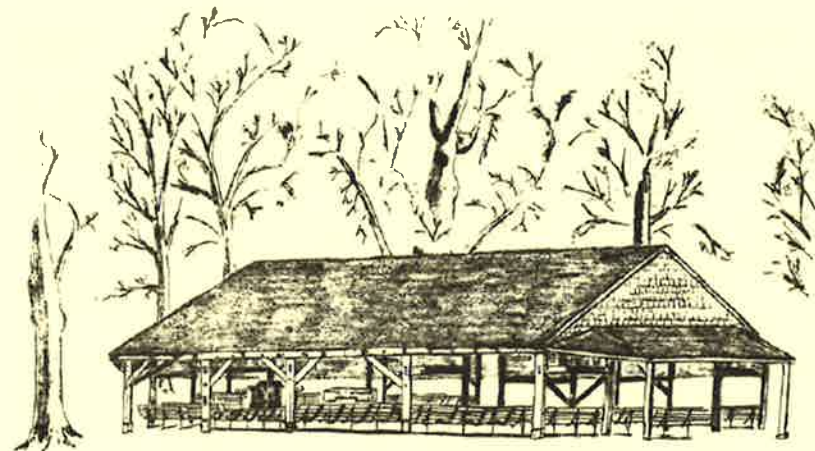
THE BETHLEHEM ARBOR Built in 1899