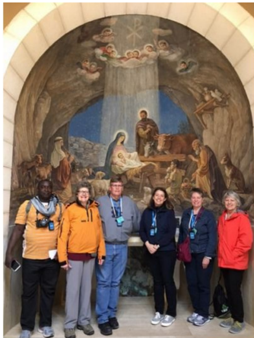
Greetings from Shepherd's Field in Bethlehem