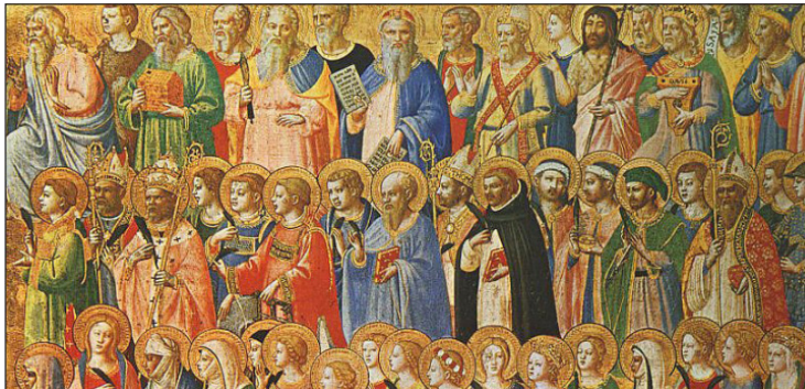
"Detail from "The Forerunners of Christ with Saints and Martyrs" (circa 1423-24) by Fra Angelico, National Gallery, London.

Almighty God, you have knit together your elect in one communion and fellowship in the mystical body of your Son Christ our Lord: Give us grace so to follow your blessed saints in all virtuous and godly living, that we may come to those ineffable joys that you have prepared for those who truly love you; through Jesus Christ our Lord, who with you and the Holy Spirit lives and reigns, one God, in glory everlasting. Amen.