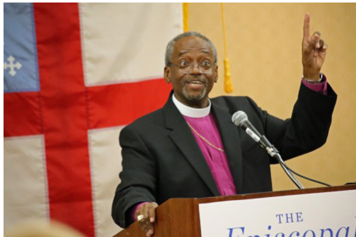
Presiding Bishop-Elect Michael Curry

The Rt. Rev. Michael Bruce Curry, Bishop of the Episcopal Diocese of North Carolina, was elected and confirmed as the Presiding Bishop and Primate of The Episcopal Church at the 78th General Convention on June 27. According to the Canons of The Episcopal Church, he becomes Presiding Bishop on November 1. Bishop Curry is the first African-American to be elected Presiding Bishop of The Episcopal Church. Bishop Curry will be the 27th Presiding Bishop, the Primate, and the Chief Pastor of The Episcopal Church. He will also serve as President of the Domestic and Foreign Missionary Society.