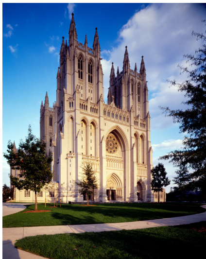
Washington National Cathedral

SE in Washington, DC. The Domestic and Foreign Missionary Society will sponsor a live webcast of the Vigil Celebration at www.episcopalchurch.org . More information on tickets for the event can be found here: http://tinyurl.com/UBEcelebration