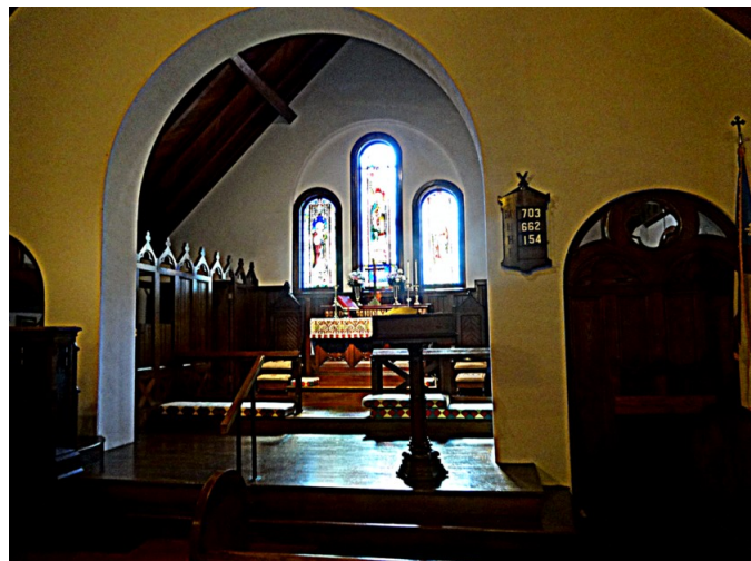
St. Andrews of the Sea, Rye, NH