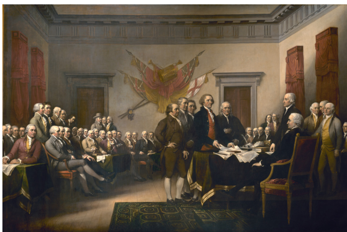
“Declaration of Independence” John Trumbull. Rotunda, U.S.

Almighty God, who hast given us this good land for our heritage: We humbly beseech thee that we may always prove ourselves a people mindful of thy favor and glad to do thy will. Bless our land with honorable industry, sound learning, and pure manners. Save us from violence, discord, and confusion; from pride and arrogance, and from every evil way. Defend our liberties, and fashion into one united people the multitudes brought hither out of many kindreds and tongues. Endue with the spirit of wisdom those to whom in thy Name we entrust the authority of government, that there may be justice and peace at home, and that, through obedience to thy law, we may show forth thy praise among the nations of the earth. In the time of prosperity, fill our hearts with thankfulness, and in the day of trouble, suffer not our trust in thee to fail; all which we ask through Jesus Christ our Lord. Amen. (Book of Common Prayer, p. 820)