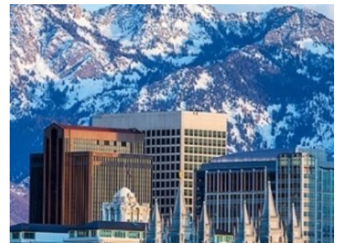
Salt Lake City, UT

Find the Media Hub at episcopalchurch.org .