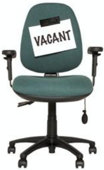
CLERK Bishop's Committee