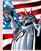
For Our Veterans

I understand that it is difficult for families to get to church due to sports and other activities on Sunday morning. Yet exposing your children to the faith is also very important. May I suggest a compromise—when your children have morning sports consider attending the 8 am service, no problem if they come