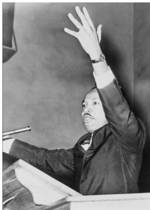
Martin Luther King, Jr., at a freedom rally, Washington Temple Church, 1962

"We've got some difficult days ahead. But it doesn't really matter with me now. Because I've been to the mountaintop. I don't mind. Like anybody, I would like to live a long life; longevity has its place. But I'm not concerned about that now. I just want to do God's will. And He's allowed me to go up to the mountain. And I've looked over. And I've seen the Promised Land. I may not get there with you. But I want you to know tonight, that we, as a people, will get to the Promised Land. So I'm happy, tonight. I'm not worried about anything. I'm not fearing any man. Mine eyes have seen the glory of the coming of the Lord."