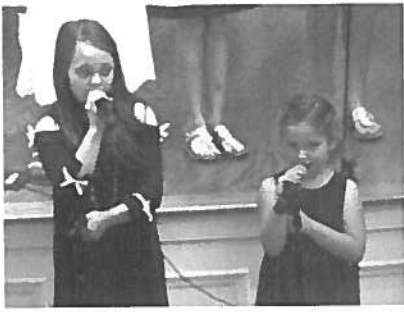
Mothers' Day 2018