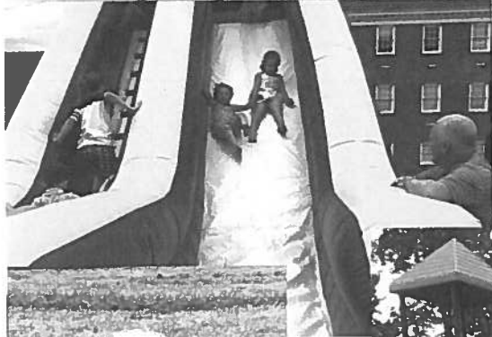
Children's End-of-School Celebration