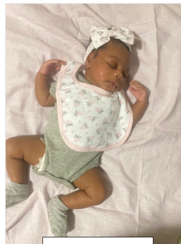
Here she is today.