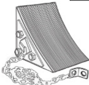
Laminated w/ optional chain