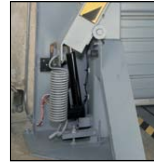
The Serco Dock Guard™ Safety Gate is powered by a simple linear actuator. An adjustable counter-balance spring provides controlled descent of the barrier arm. Proximity switches safely monitor its position.