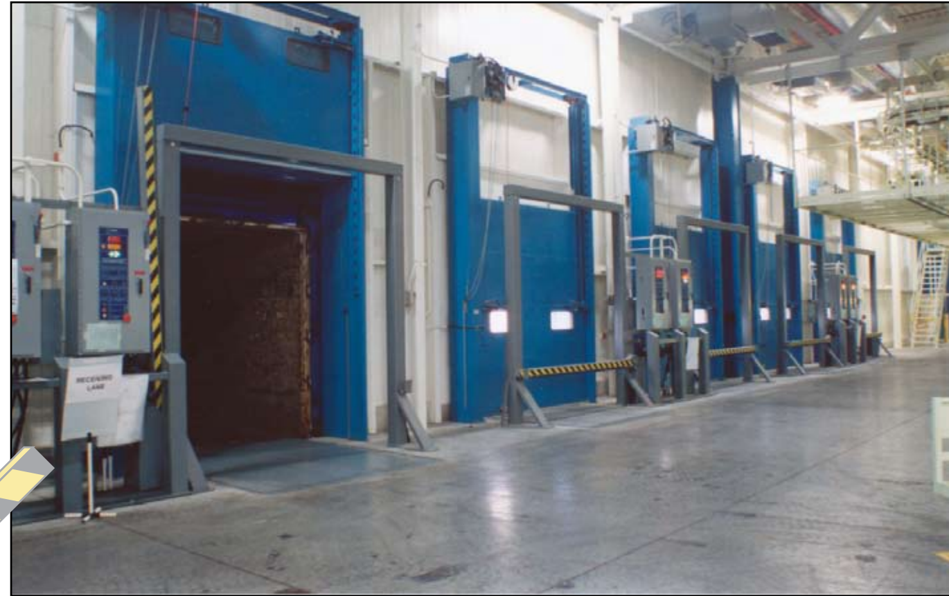
Serco Safety Gates can be interlocked with vehicle restraints and are designed to operate after the vehicle is locked firmly in place.