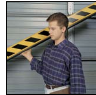
The safety edge on the barrier arm is designed to automatically reverse if it contacts an obstruction during the lowering cycle. (Standard on DGB-P).

The Safety Gate can be independently operated by the dock attendant through a control panel mounted on the dock wall. The system can also be operated by a coordinated, interlocked master control panel with the operation of the dock leveler or vehicle restraint. Once the truck is restrained and the door open, the Safety Barrier opens automatically for forklift truck access. Once the door or restraint is restored the gate automatically closes.