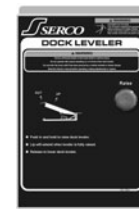
Standard Steel Interlock Capable Single Push-button Control Panel

30K-50K LB. (13.6-22.7 KG) CAPACITY RATINGS