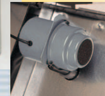
Low Pressure Fan Motor