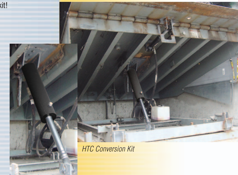
HTC Conversion Kit