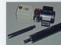
Motor & Cylinders