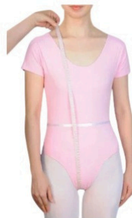
Upper body Girth