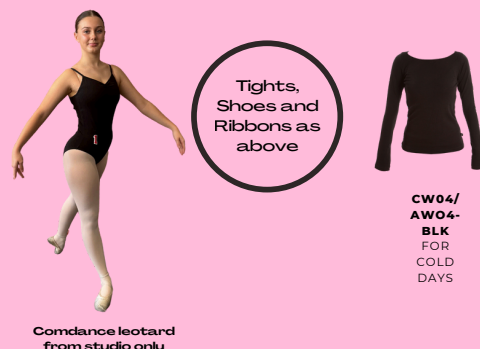
CW04/ AW04- BLK FOR COLD DAYS