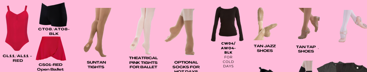
CL11/AL11 - RED

Beginners, Juniors, Inters and Advanced uniform - available from Energetiks Fountain Gate or the studio