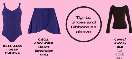
CL11/AL11- DEEP PURPLE

Grade 3 and 4 Ballet Exams - available from Energetiks Fountain Gate or the studio