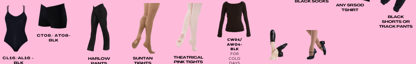
CL16/AL16 - BLK

Pre-Senior upwards uniform - available from Energetiks Fountain Gate or the studio