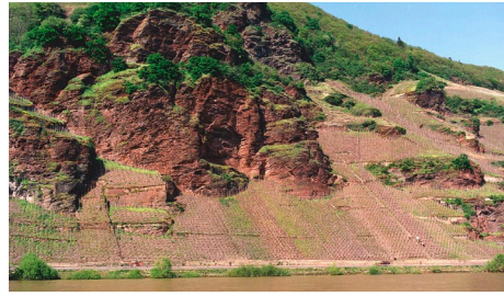
Erdener Prälät Vineyard