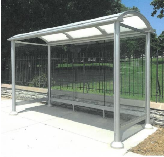
Full-size Proposed Shelter (additional amenities not pictured - e.g. solar lighting, ad panel, branding, trash can etc.)