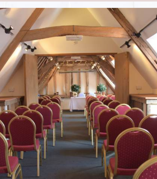
The Oak Rooms

The Oak Rooms are situated a 3-min walk from Applewood Hall in the Appleyard Courtyard next to a small meadow that can be used for photos and next to the Banham Barrel pub.